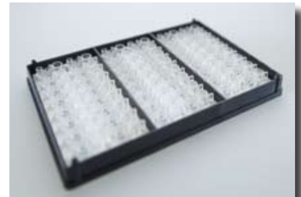
right – QPlate produced by thinXXS – the heart of Sophion's QPatch HT system. This hybrid microfluidic chip combines micromolding, silicon sensors and printed circuit board technology.