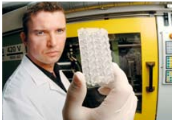
left – microfluidic interface to HTS automat

Leonardo da Vinci hand study, circa 1484–1486